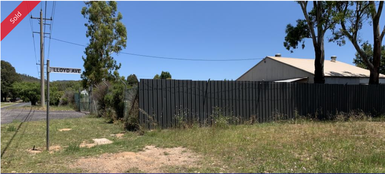
61 Ilford Road, Kandos